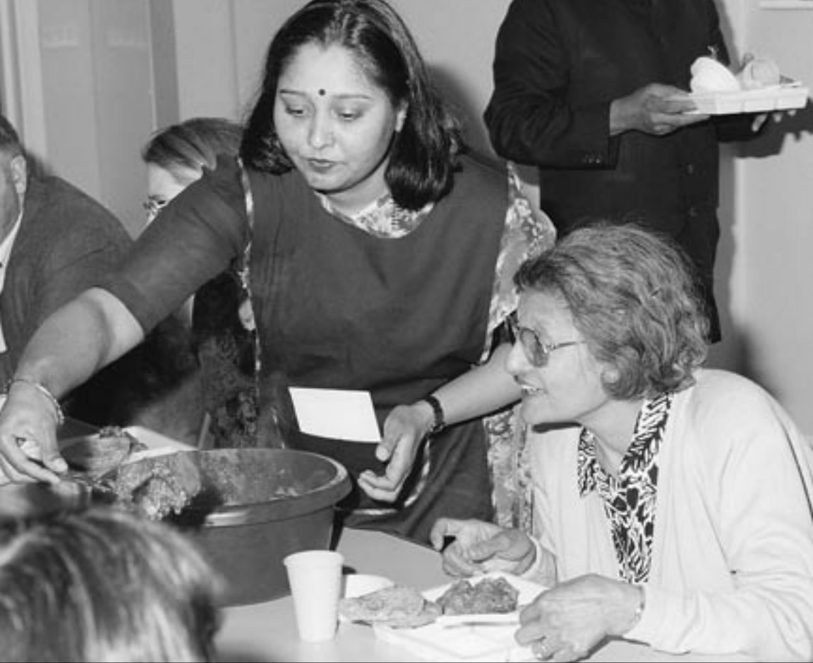
Service; photo, courtesy, Alan Race