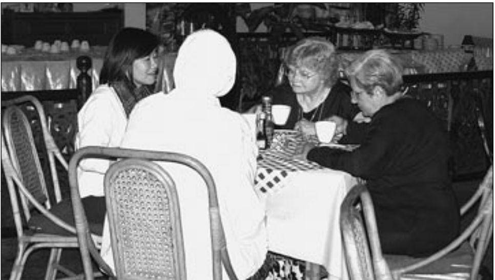
Dinner at My House

We are women from a variety of faith traditions who work together for deeper understanding and cooperation among religious justice-seekers. We call on the people of the United States of America to use words and actions that will lead to healing and reconciliation on the first anniversary of the violent attack on the