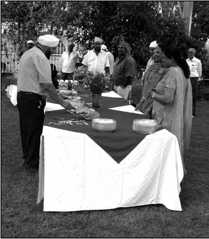
Family Life

home. For a Sikh the “home is a sacred place where the troubles and anxieties of the world cannot enter.” 26 In spite of our labels, many of us return to our homes and become fathers and mothers,