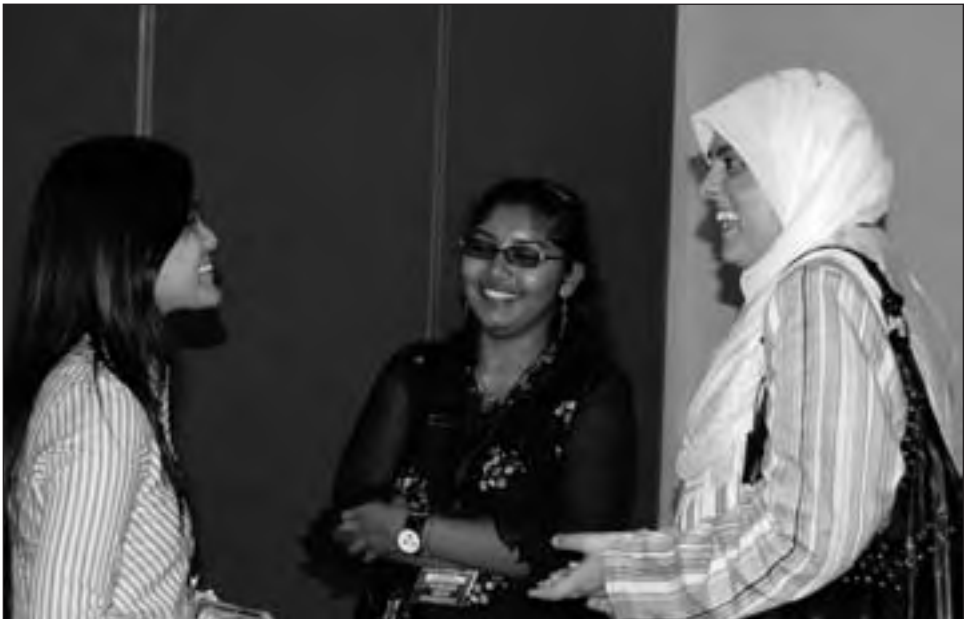
Mutual Respect; photo, Cetta Kenney

The Qur'an exhorts Muslims not to discriminate between people on the basis of race, color, languages, nationalities etc., as these are also signs of Allah's