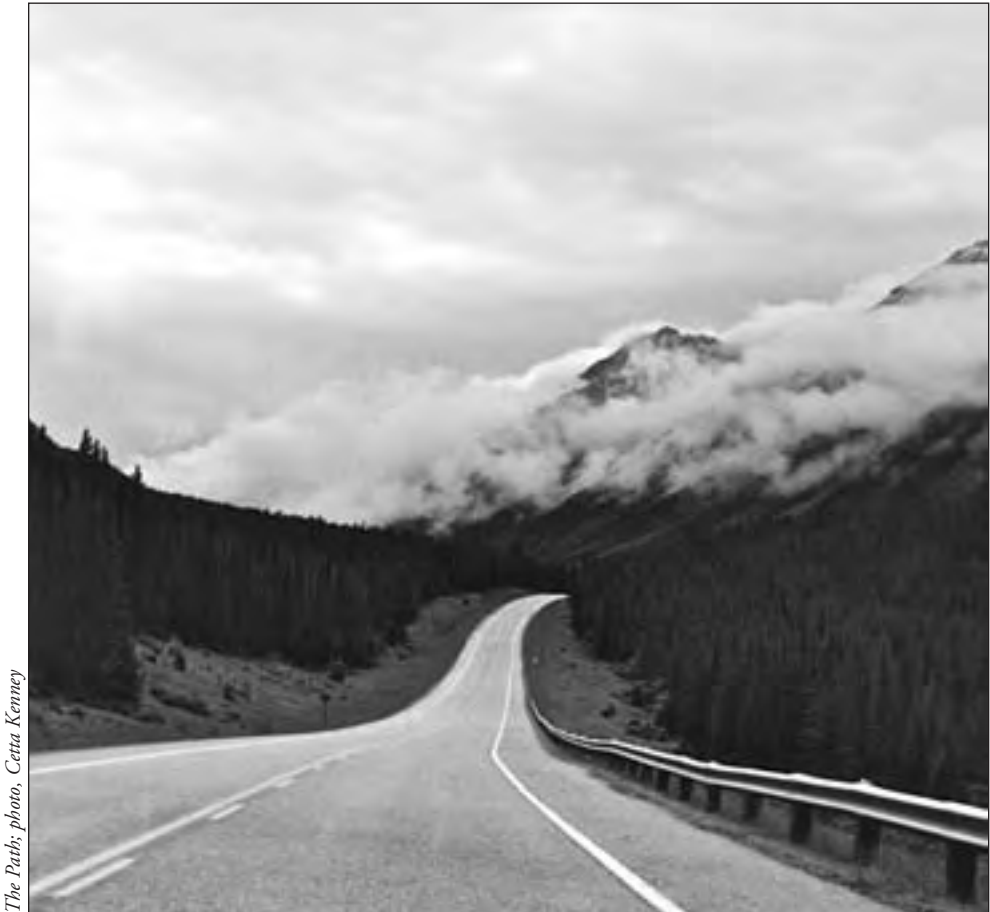
The Path, photo, Cetta Kenney

These verses reveal the fundamental principles of the Qur'anic perspective on interreligious relations, which emphasize that there is no compulsion in matters