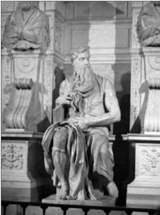
Michelangelo's Moses: public domain