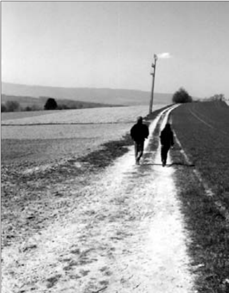
Companions; photo, Cetta Kenny

Spiritual direction is a process aimed at helping individuals to notice, savor and respond to the presence of divinity/spirit/essence in their lives. This companioning process generally serves